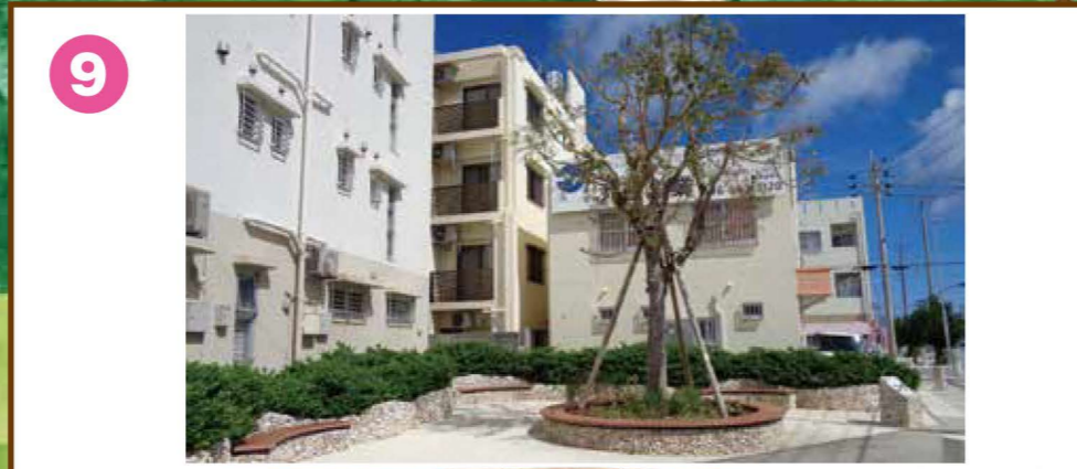
9 Wakasa Plaza ~Kuninda-no Nakayukui 'Rest Spot'~ Surrounded by historic landmarks like Fukushuen Garden and Naminouegu Shrine, this plaza is ideally located along popular guided walking routes and serves as a cultural hub. It was developed to foster interaction between locals visiting nearby Matsuyama Park and travelers visiting Okinawa from around the world.

This leaflet introduces "Exchange Oasis Plazas" and "Historical Paths" serving as hubs for relaxation and interaction for visitors to Naha, aiming toward urban development befitting a "Subtropical Garden City." We have established the nine Exchange Oasis locations shown on this map to provide residents and visitors alike with dedicated spaces for rest and interaction.