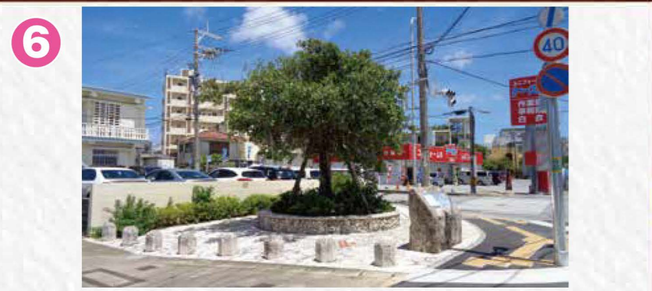
6 Orokubaba (Oroku Horse Field Site) Plaza ~Baba Horse Track Entrance Plaza in Oroku~ Leading to the historic site of the former Oroku village 'Baba' horse track, this space invites visitors to experience the rich heritage and culture of the area through interaction with the local community.