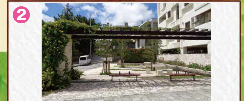
2 Ryutan Plaza ~Ryutan (Pond) Waterfront Plaza~ A location facing the waterfront where water flows down into Ryutan (Pond) from the Sui Mui forest of Shurijo Castle. Developed as an open space where local elementary school children and touring visitors can enjoy a safe and comfortable environment to rest.