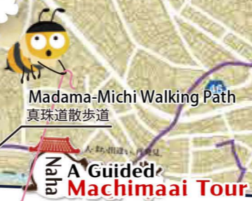
Madama-Michi Walking Path 真珠道散歩道 Naha Machimaai Tour

Following our theme of 'strolling through the neighborhoods of Naha with a guide,' our tour guides, who are well-versed in the history and culture of Naha, will lead you on a fun-filled walking tour, peppered with interesting local episodes. Naha Machimaai Office, Naha City Tourism Association TEL : 098-860-5780 (9 : 00~17 : 00) URL: https://book.naha-navi.or.jp