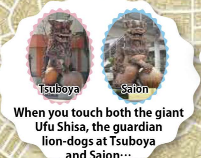
When you touch both the giant Ufu Shisa, the guardian lion-dogs at Tsuboya and Saion...