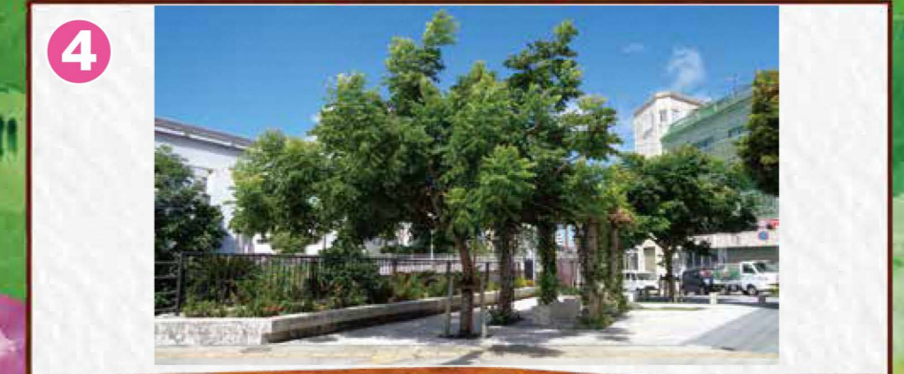
4 Sogenji Bridge Plaza ~A Waterfront Town Naa (Garden)~ Located at the foot of Sogenji-bashi Bridge facing the Asato River, this site has high accessibility to the water. Developed as a plaza that is highly visible from the monorail and harmonizes with cultural heritage sites such as the Sogenji Stone Gate in the heart of the city.