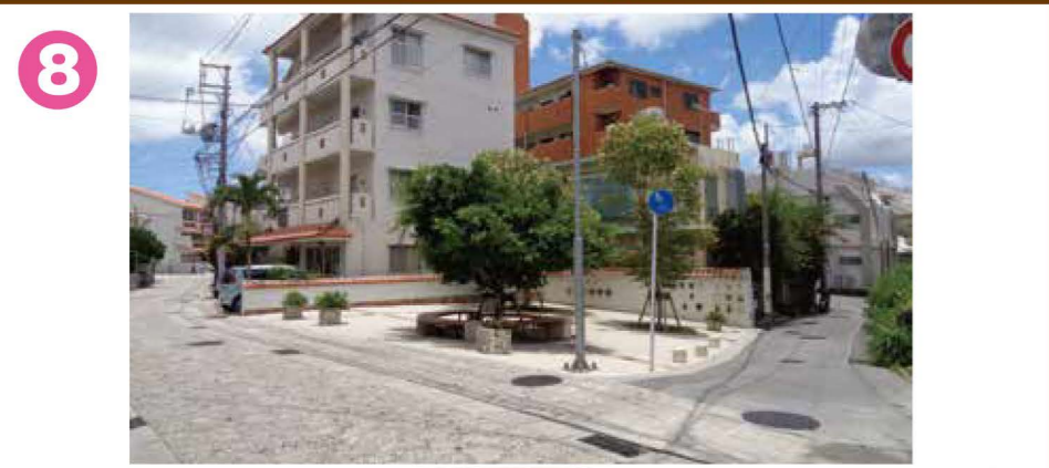
8 Tsuboya Yachimun (Pottery) St. Plaza ~Yachimun-no Nakayukui 'Rest Spot'~ With its beautiful cobblestone paths and traditional architecture, this area offers a timeless streetscape in a unique and charming atmosphere. This 'Nakayukui' rest stop invites visitors exploring the Yachimun pottery district to enjoy a break while engaging in meaningful interaction with the local community.