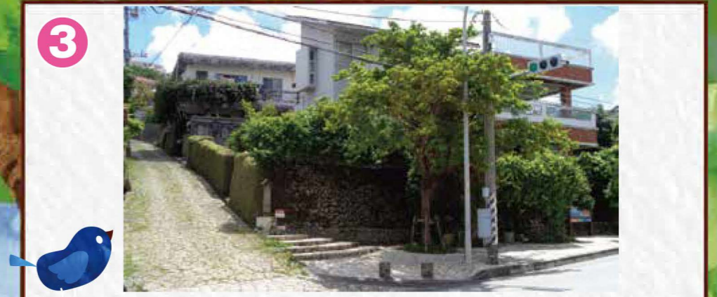
3 Shuri Kinjo-cho Stone-Paved Road Plaza ~A Nakayukui 'Rest Spot' Along the Ancient Path~ A rest area located along the historic Madama-Michi, a major road that connected Shurijo Castle to the port, on the way down the steep slope from Shuri to Shikina. Developed as a peaceful space where people can rest and cool off while strolling the area.