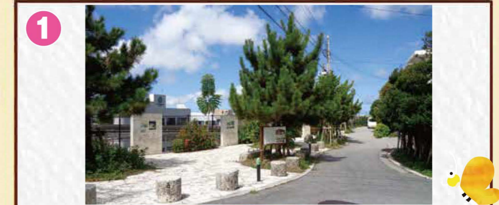
1 Nishimui Park ~Creation of a Nishimui Atmosphere, the Center for Artistic Expression~ The birthplace of post-war artistic restoration. Inheriting the local spirit by exhibiting artworks from that era. Developed as a space with high visibility from the monorail.

Road Construction Division, Urban Future Department, Naha City