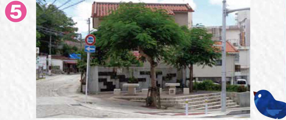
5 Tsuboya Yachimun (Pottery) St. Entrance Plaza ~The Tsuboya~ Situated at the gateway to Tsuboya Yachimun Street, this space was developed to serve as a symbolic landmark for the district, using local materials to capture the unique atmosphere of Tsuboya, the home of Yachimun pottery.