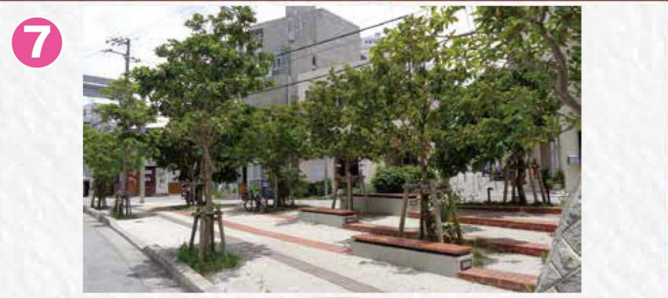
7 Sakurazaka Plaza ~The Ippuku 'Rest Spot' Plaza at Sakurazaka~ Nestled in the heart of the bustling Sakurazaka district, home to popular nightlife tours and endless local bars, this space was developed as an oasis to refresh and catch your breath from the vibrant energy of Sakurazaka at night.